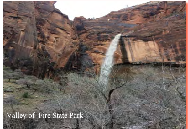
Valley of Fire State Park

Running and hiking in Zion the next morning, then an afternoon drive to our first destination in Page, Arizona. Page is the stage for the Antelope Canyon Ultra Trail Races that include distances of 100 miles, 50 miles, 55k and a long half marathon (13.8 miles). VacationRaces.com directs this and many other Road/Trail running races centered near National Parks or other scenic locations.