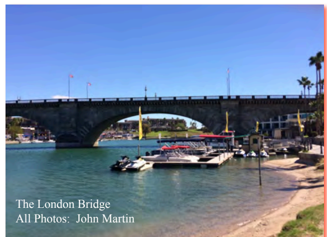
The London Bridge

Westward ho to Lake Havasu City, home to the London Bridge. The designed city of Lake Havasu was the brainchild of Robert McCullough (think chainsaws). City construction began in 1965 and the London Bridge was purchased in 1967, relocated and reassembled on dry land. A channel from the Colorado River was dug out under the bridge from the main city to the peninsula that is now an island. The London Bridge sports bullet wounds from WWII German fighter planes. The lampposts on the bridge were made from the recycled metal of Napoleon Bonaparte's cannons used in the battle of Waterloo. We know how that turned out! Fact: London bridge is the largest antique ever sold.