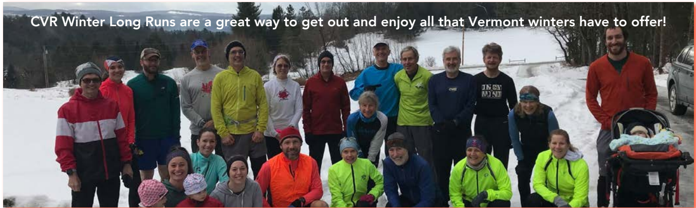
CVR Winter Long Runs are a great way to get out and enjoy all that Vermont winters have to offer!