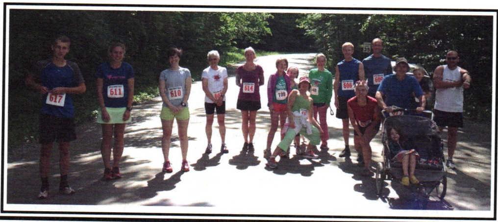
Results page 8